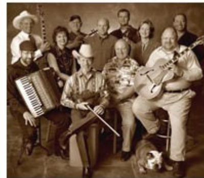
The Time Jumpers Artists of the Week

Western Swing band comprised of Nashville's finest studio musicians and vocalists.